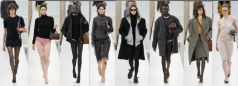
Grays Black White