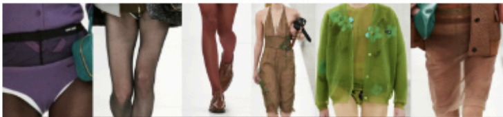
Material: Mesh, Nylon, Chiffon, or Tulle Pattern: Polka Dots, Plain