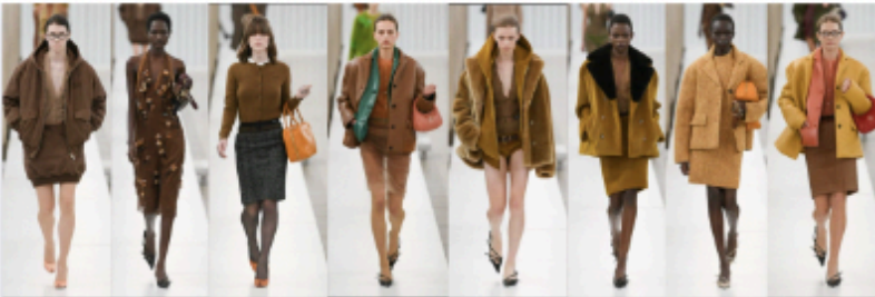
Browns Yellows Reds