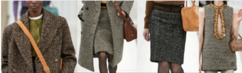
Material: Wool Texture: Tweed Patterns: Herringbone, Overchecked