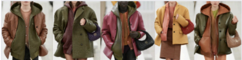
Material: Leather Texture: Smooth, Pebbled Pattern: Flower Motif, Alternating (silver and colored rhinestone) , Buckle Motif